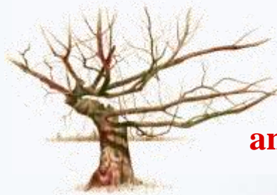
an old tree